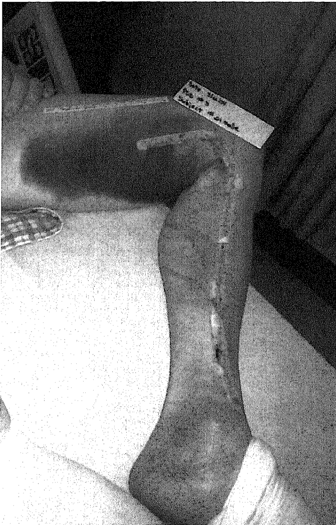
Figure 2. Postoperative day 3 leg incision, control group.